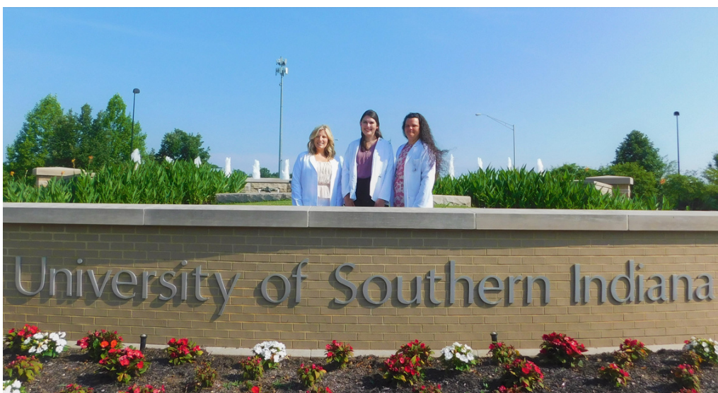
2022-2023 Nurse Practitioner Residents

The residents focus will be both clinical and academic enhancements that will assist in the transition from academia to practice and prepare them as primary care providers. The residency program includes precepted clinical practice, specialty rotations, mentoring sessions and enhanced didactic education.