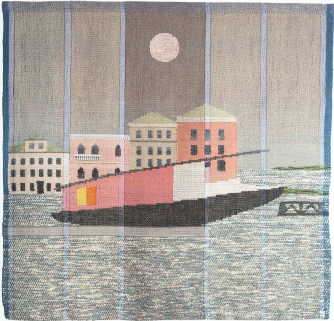
Vaporetto, Grounded , 2020 Wool, mylar, cotton 31 x 31 in.