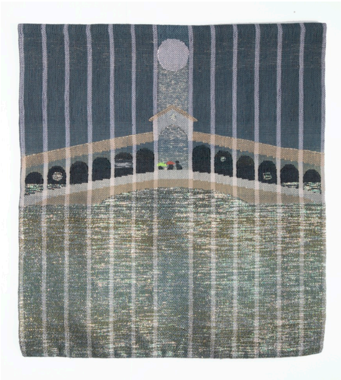
The Rialto Bridge, Flooded, 2020 Wool, mylar, cotton 31 1/2 x 28 1/2 in.