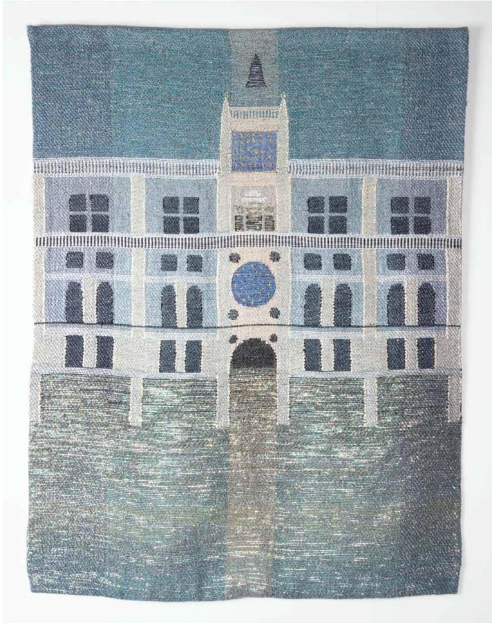
Horologio, Flooded, 2020 Wool, mylar, cotton 34 x 25 in.