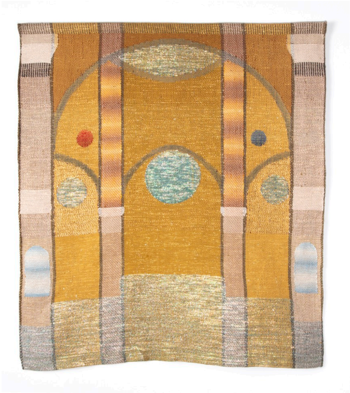
The Crypt, Flooded, 2020 Wool, mylar, cotton 30 x 27.5 in.