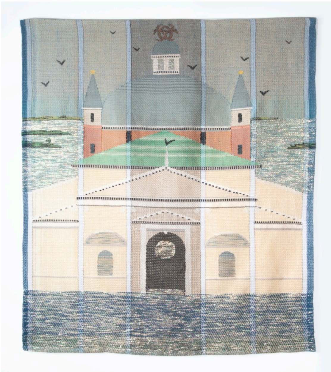
Il Redentore, Flooded, 2020 Wool, mylar, cotton 37 x 31 in.