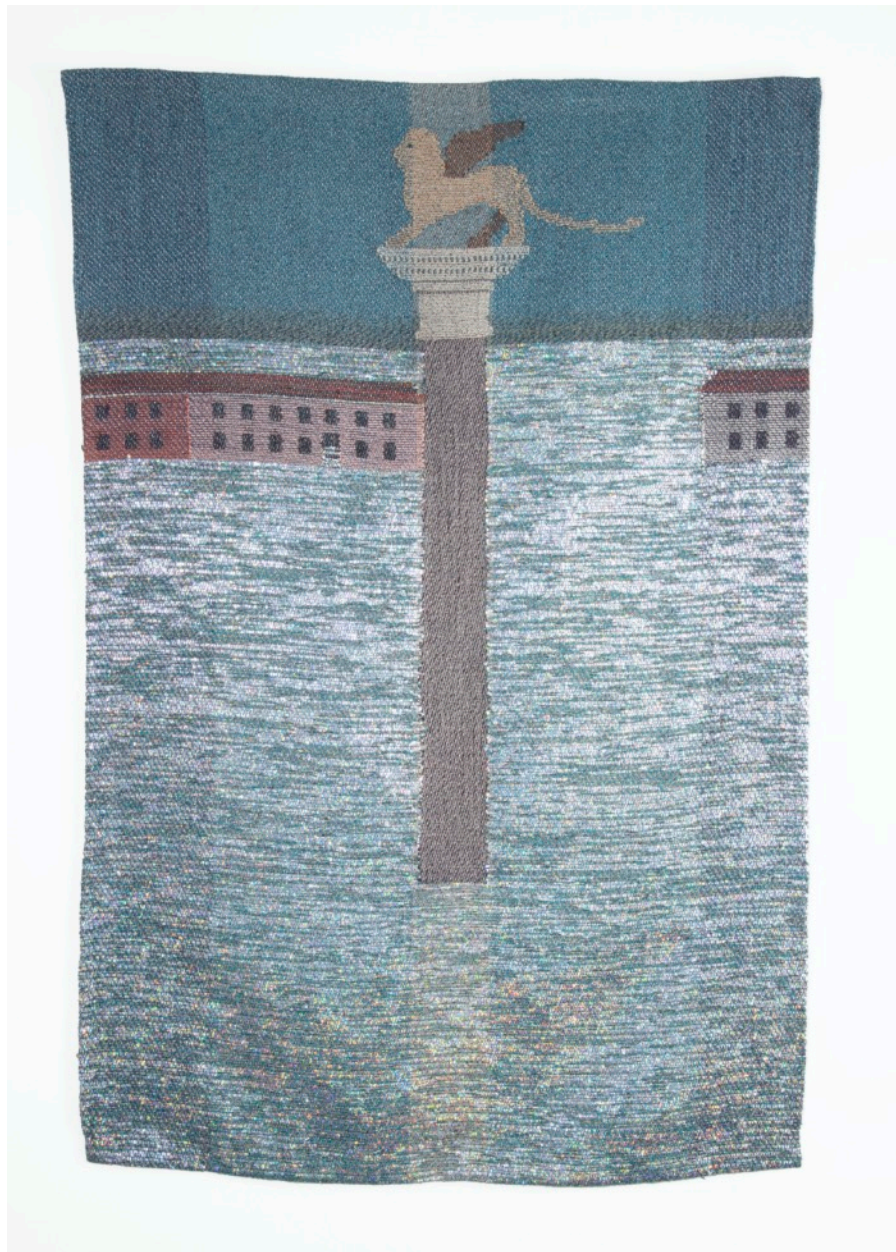
The Lion of St. Mark, Flooded, 2020 Wool, mylar, cotton 38 x 26 in.