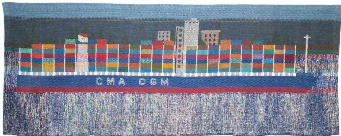
CMA CGM , 2021 Wool, mylar, cotton 27.5 x 68 in.