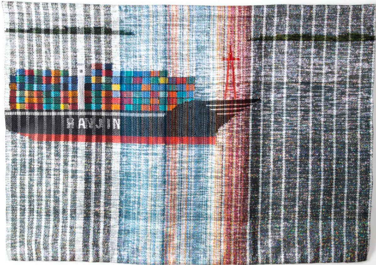
Hanjin , 2021 Wool, mylar, cotton 31 x 43.5 in.