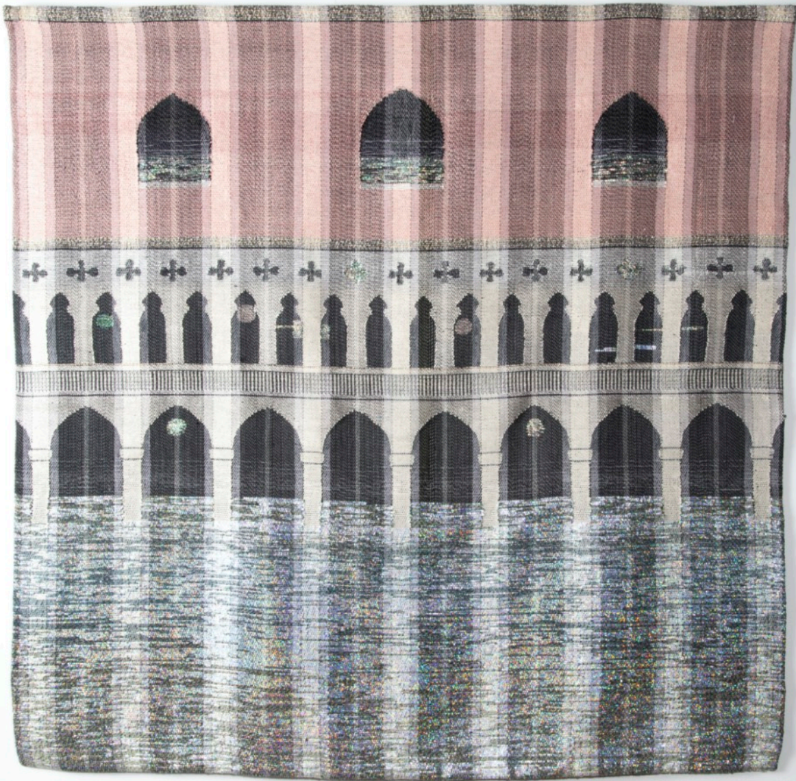
The Doge's Palace, Flooded, 2020 Wool, mylar, cotton 40 x 41 in.