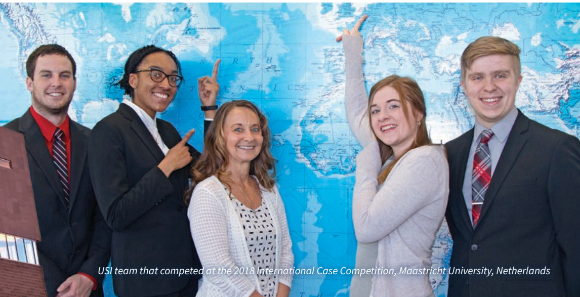
USI team that competed at the 2018 International Case Competition, Maastricht University, Netherlands

Our students also compete in a number of business case competitions, such as the Alberta Not-for-Profit Case Competition and the IMA National Student Case Competition, in which a USI team has been the national champion five times.