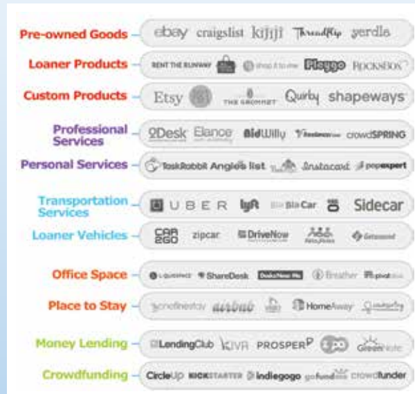
Image adapted and used with permission from Crowd Companies and Vision Critical