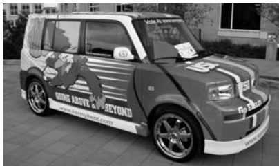
USI Scion Design