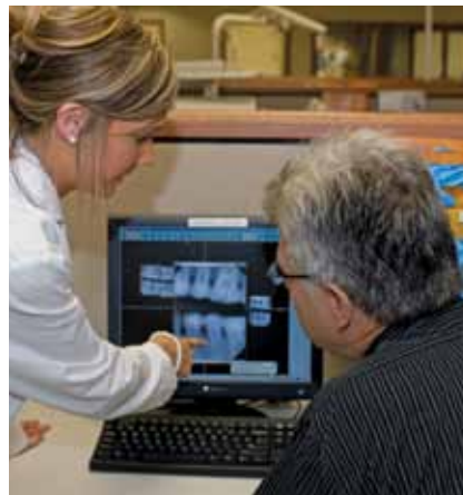
Digital radiography in the dental clinic provides a film for immediate viewing on the computer screen.