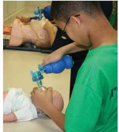
An HCAMPS student practices rescue breathing for infants.