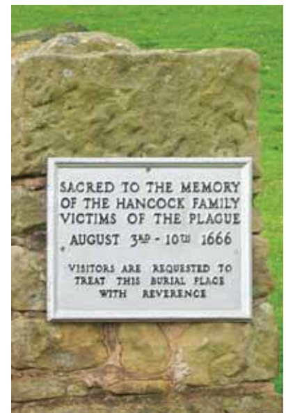
Students visited the village of Eyam, which honors the memory of residents who died during a bubonic plague outbreak.