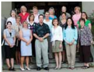
Students in the second DNP class gathered on campus in August.

Students in the second class of students in the college's Doctor of Nursing Practice program attended their first on-campus intensive sessions in August.