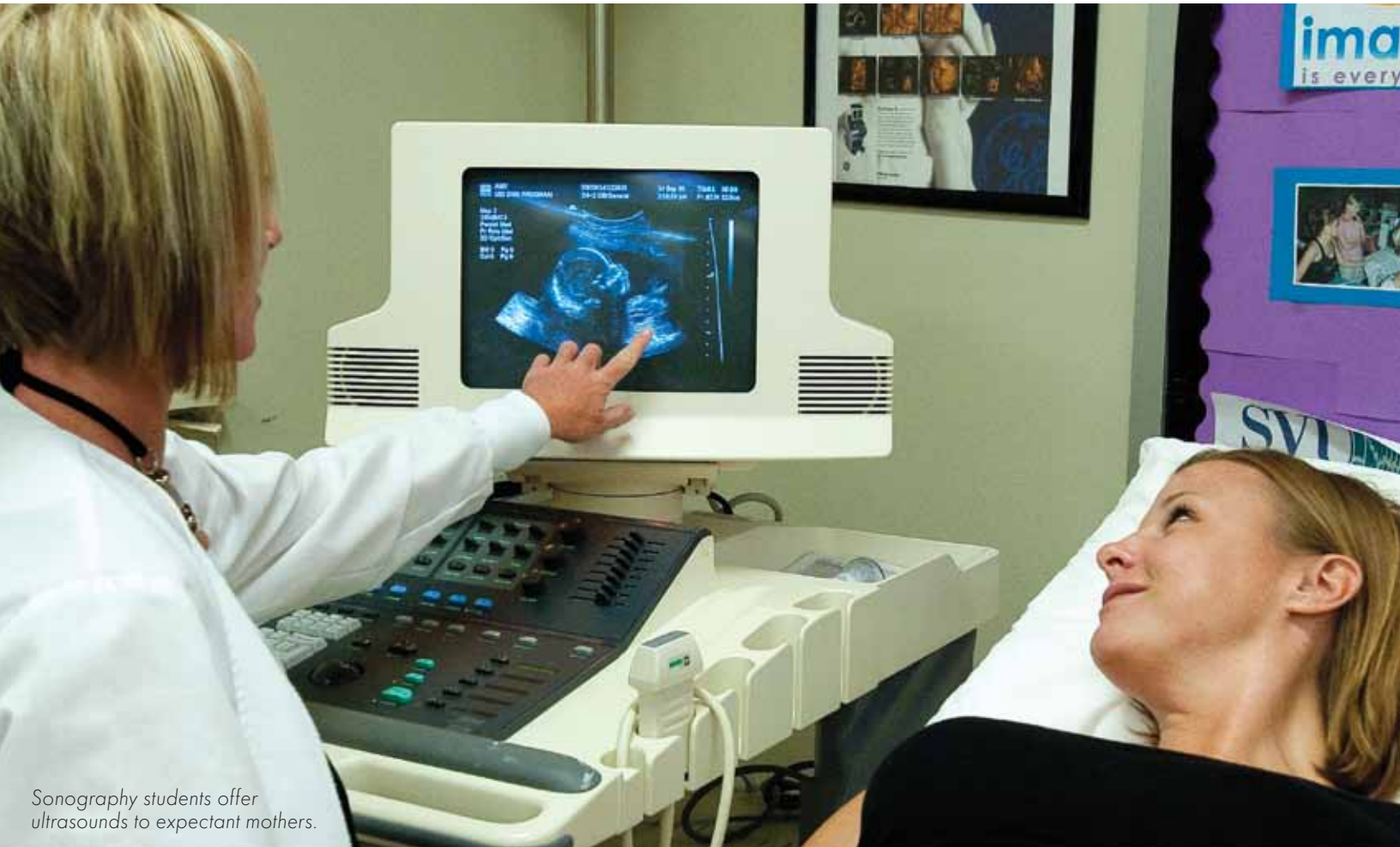
Sonography students offer ultrasounds to expectant mothers.