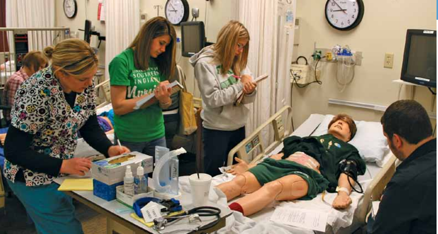
Clinical simulation allows students to practice skills in a safe environment.

A SimMan patient simulator also is located in a room on the lower level of the Health Professions Center that includes a new observation area. A demonstration there can be viewed via monitors from any room in the Health Professions Center. The additional space allows students in various disciplines to use technology at the same time for diverse needs. From the observation area, nursing students can view, but not intrude upon, a telemedicine session with permission from the patient's family. Students in the master's program in nursing use the area for patient assessment.