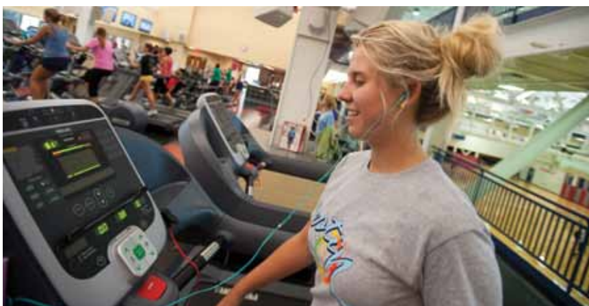
Students can access podcasts of faculty presentations whenever and as often as they like.

Nursing Central is used in the undergraduate nursing program. A similar arrangement provides the Epocrates® software package for students and graduates of the master's program in nursing.