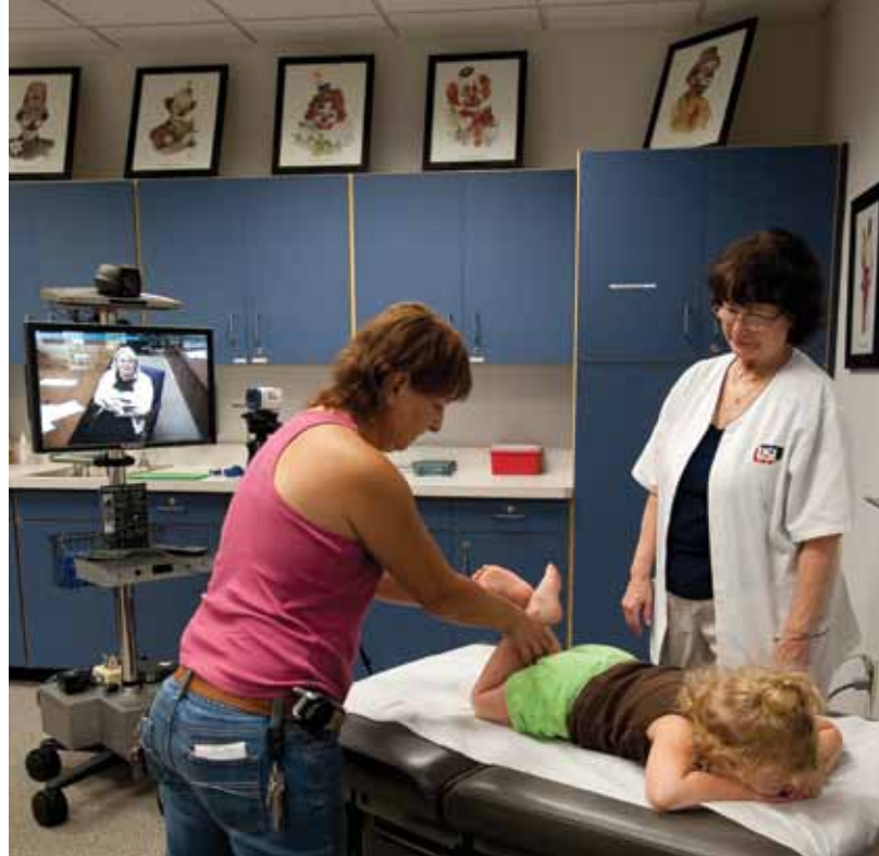
Patients and their families communicate from the telemedicine lab in the Health Professions Center with physicians at Shriners hospitals in St. Louis and Cincinnati.

The college's state-of-the-art Clinical Simulation Center includes four SimMan® advanced patient simulators, a SimBaby®, and a virtual IV arm. Faculty in several disciplines have developed scenarios in which students mimic situations they may encounter in a real clinical setting.