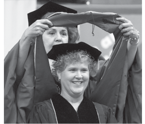
The first class to graduate from the DNP program received degrees in May 2011.

The first DNP class to graduate, in May 2011, are recognized as graduates of a CCNE-accredited DNP program.