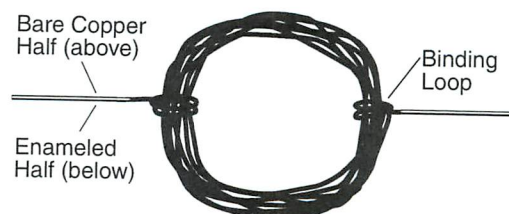
Figure 2. Coil Armature